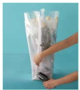
STEP 5: Bring both lengthwise edges of the cellophane and tissue up so they meet over the top of the arrangement, fold and neatly staple together the top corners of both sides as shown in figure 2.

STEP 6: Fold bottom edge of cellophane and tissue up to cover the vase packer, as shown in figure 3.