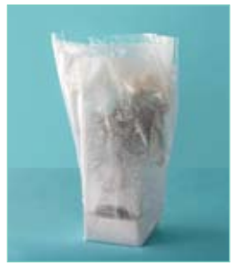
FINISHED PRODUCT IMAGE

STEP 3: Attach Martha Stewart for 1-800-Flowers.com branded floral food packet to the vase packer so that it is visible from the same side as the enclosure card envelope, as shown in figure 1.