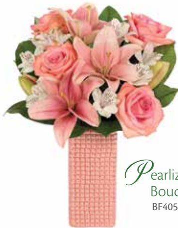
Pearlized Perfection Bouquet BF405-11KM