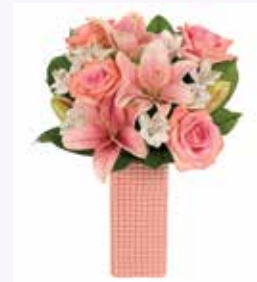
Pearlized Perfection Bouquet BF405 - 11KS/M/L