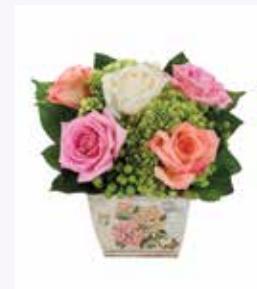
Hydrangea Rose & Garden Bouquet BF399 - 11KS/M/L