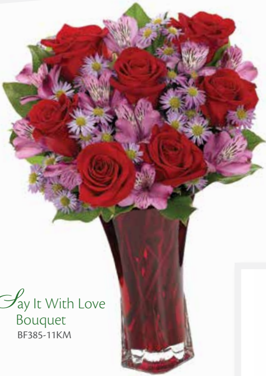
Say It With Love Bouquet BF385-11KM