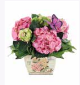
Hydrangea Plant Garden BF399 - 11KM