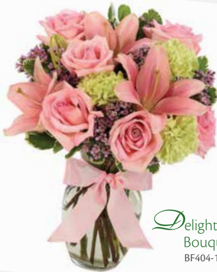
Delightfully Fresh Bouquet BF404-11KL