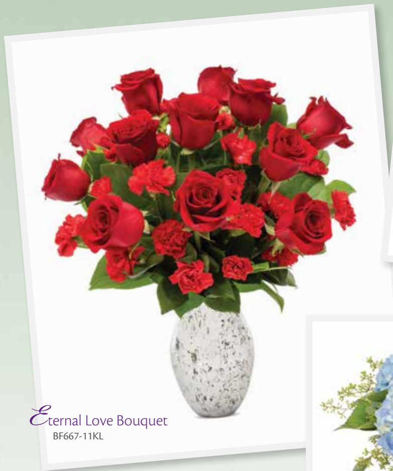
Eternal Love Bouquet BF667-11KL