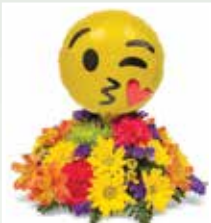
BF708-11KM Blowin' Kisses Emoji Surprise