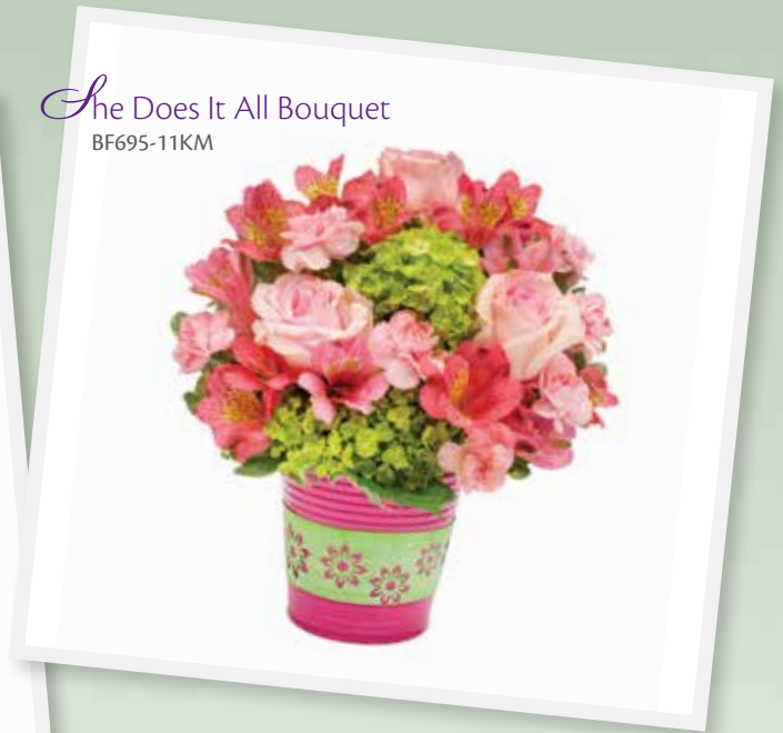
She Does It All Bouquet BF695-11KM