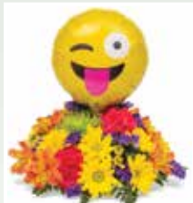
BF709-11KM Just for Fun Emoji Surprise